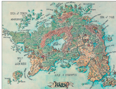
Poetic Map of Hârñ

Published by Columbia Games Inc. and Kelestia Productions, the detailed environmental information has slowly grown to include the western area of the continent of Lÿthia, including the Ivinian kingdoms in the north and the kingdoms of Shôrkyrnè and Emèlrenè.