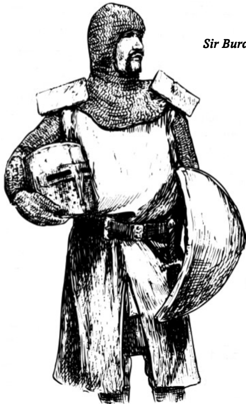
Sir Burdas Kandry

Sir Burdas' younger brother, Mikel, was born eight months after his father's death. This, combined with the fact that Sir Burdas' mother was 49 when she gave birth has led to whispers that Lady Anna was having an affair with a demon or worse. Mikel is currently a squire at Holdir manor. Thus far, he has been a reasonably normal lad, but any unusual occurrences will be attributed by some to the Mikel's supposed "otherworldly" nature.